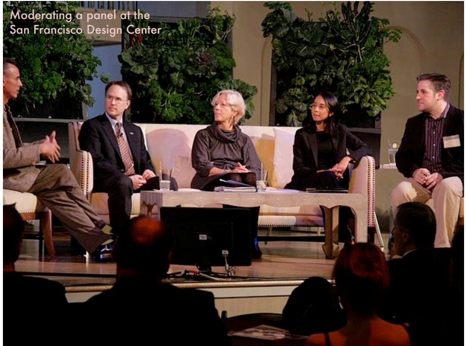
Moderating a panel at the San Francisco Design Center

Half and full day workshops also available by request.