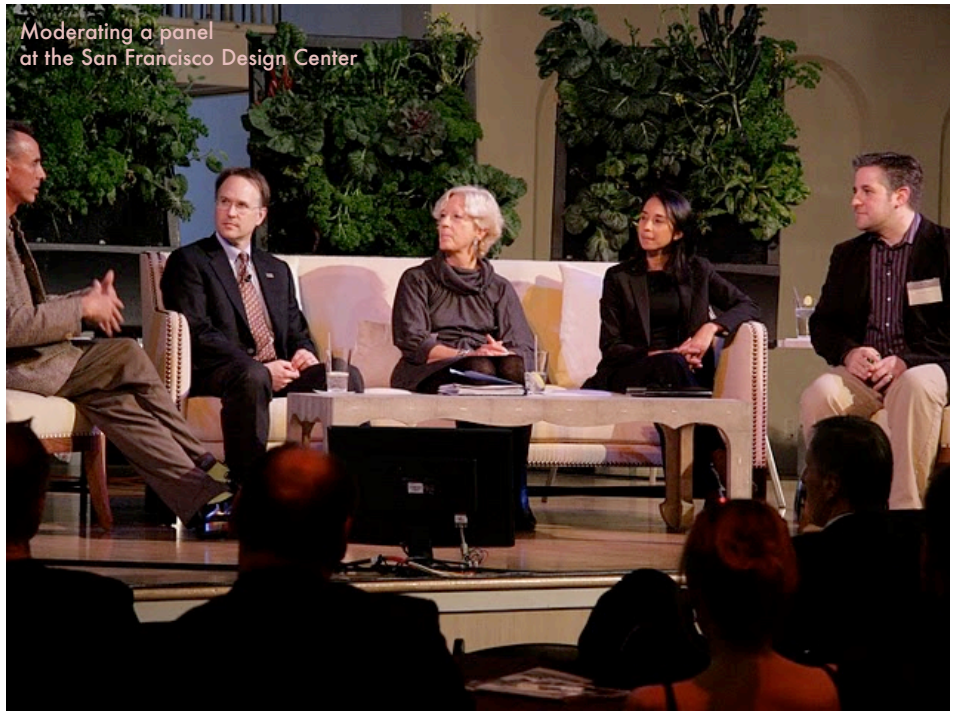
Moderating a panel at the San Francisco Design Center

Half and full day workshops also available by request.